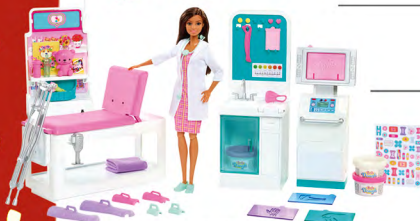
BARBIE DOUTORA COM CLINICA MEDICA