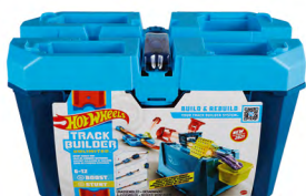
HOT WHEELS TRACK BUILDER CAIXA DE ACROBACIAS