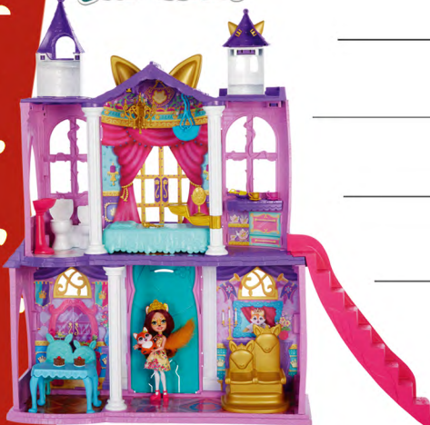
ROYAL ENCHANTIMALS CASTELO PARA BAILE REAL