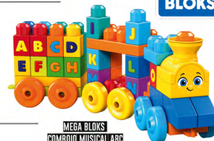
MEGA BLOKS COMBOIO MUSICAL ABC