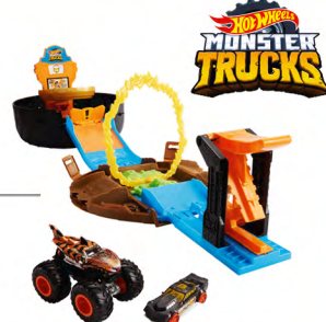
HOT WHEELS MONSTER TRUCKS PISTA RUEDA ACROBACIAS