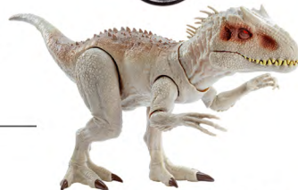
JURASSIC WORLD INDOMINUS REX DINO-DESTRUTOR