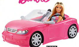
BARBIE E O SEU DESCAPOTÁVEL