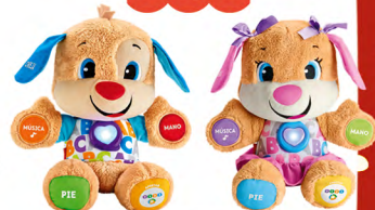
CAZINHO/MANA DO CAZINHO PRIMEIROS DESCOBRIMENTOS